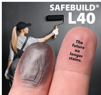
YSHIELD® SHIELDING PAINTS

YSHIELD GmbH & Co. KG 94099 Ruhstorf, Germany www.yshield.com info@yshield.de